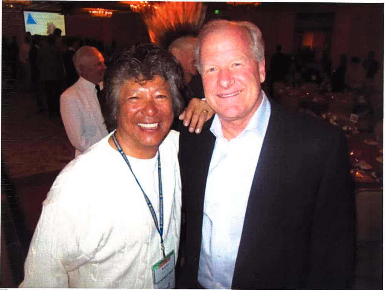
Photo of the author and the author's father at the 2010 IEEE International Conference on Systems, Man, and Cybernetics (SMC).